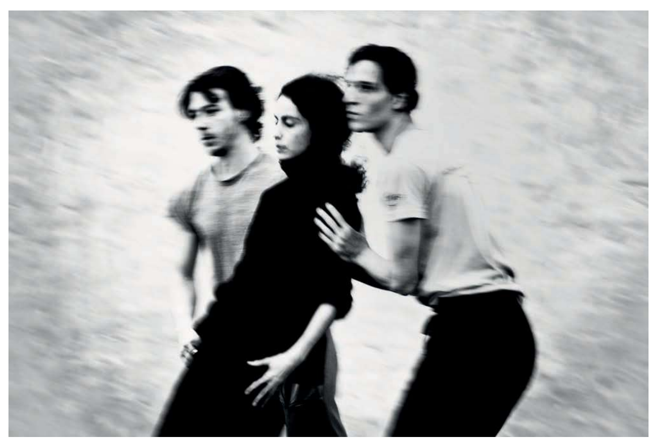
Photo by Daniela Neri, Playing Identities: Creolisation, Creation, Migration