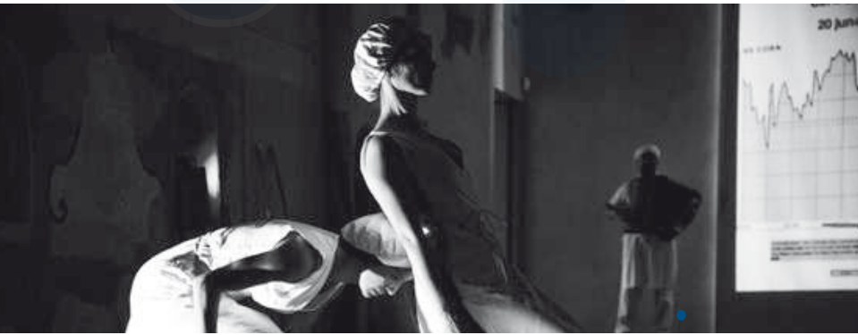
Pictures: L'ALA - Made in Italy - Balletto Civile with IaLut. Photographic Exhibition Creolimage\Playing Identities - SMS Siena 2011 by Daniela Neri

Performing Heritage Audience Engagement & Development Intangible Commons Creolisation Crowdsourcing